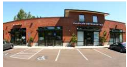
Typical wide angle lens